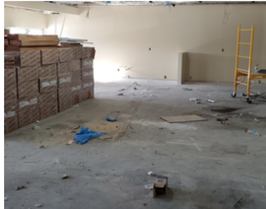
Middle School – Third Level Restroom Tile and Plumbing Fixtures Installation